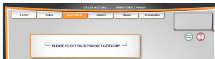
Picture 1. Interface

User. Regular user is able to choose the type of image printing (digital printing or laser etching), select product, customize artwork, templates, and text.