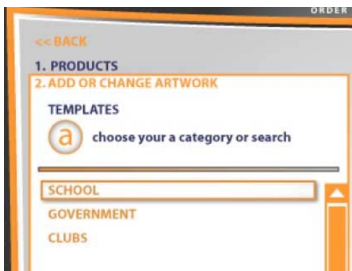
Picture 7. Template Category Selection