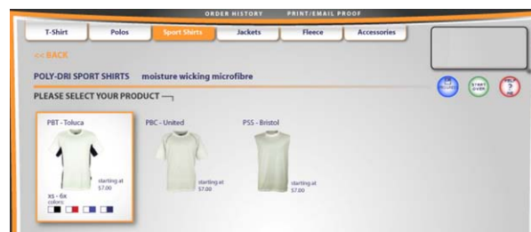
Picture 2. Select product category

User can select a product according to its size, price without decoration and coloring options.