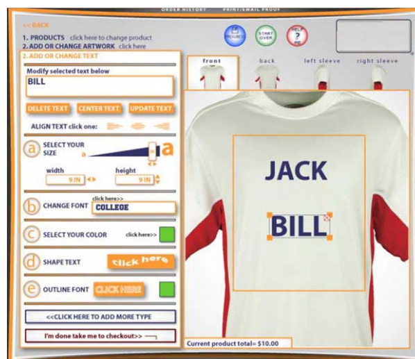
Picture 9. Text Customization