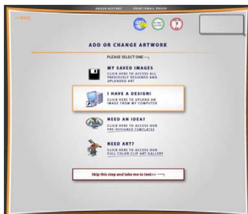
Picture 5. Adding or Changing Artwork