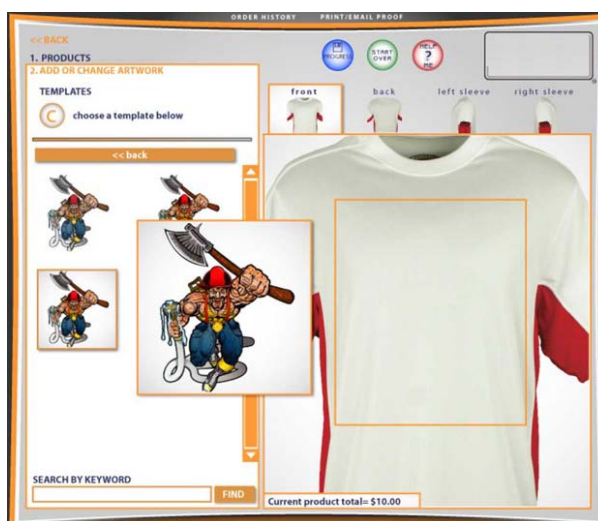
Picture 8. Template Selection

User is able to select a template from a list of pre-made templates.