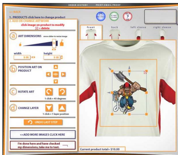
Picture 6. Artwork Configuring