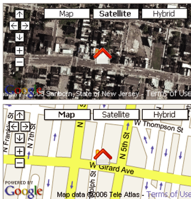
Picture 4. Map

We integrated Google Map to give more information about the addresses and places of real estate items. Coordinates of every item are saved on the server side and download to the map via a geocoder.